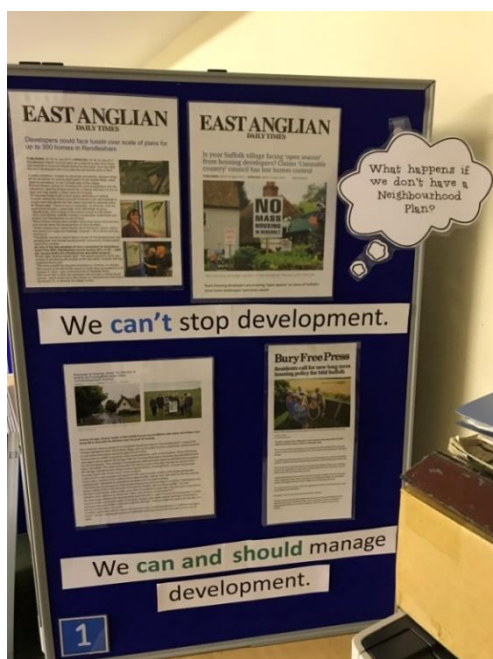
October 2017 consultation