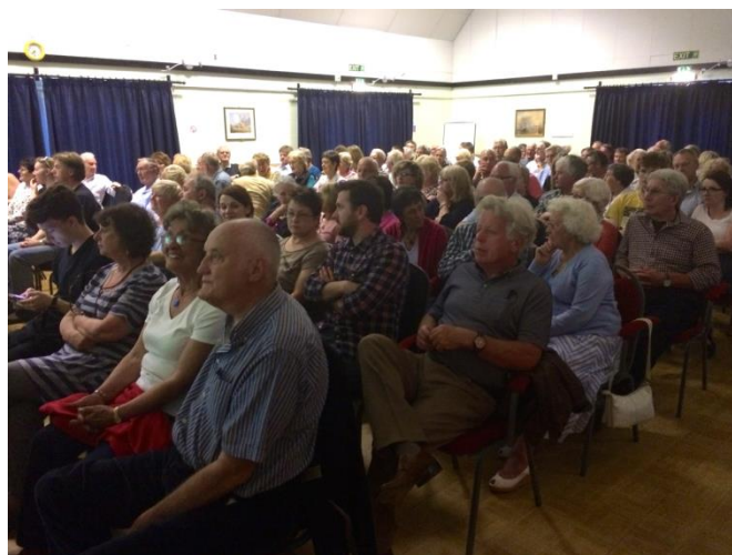
May 2014 Neighbourhood Plan Open Session