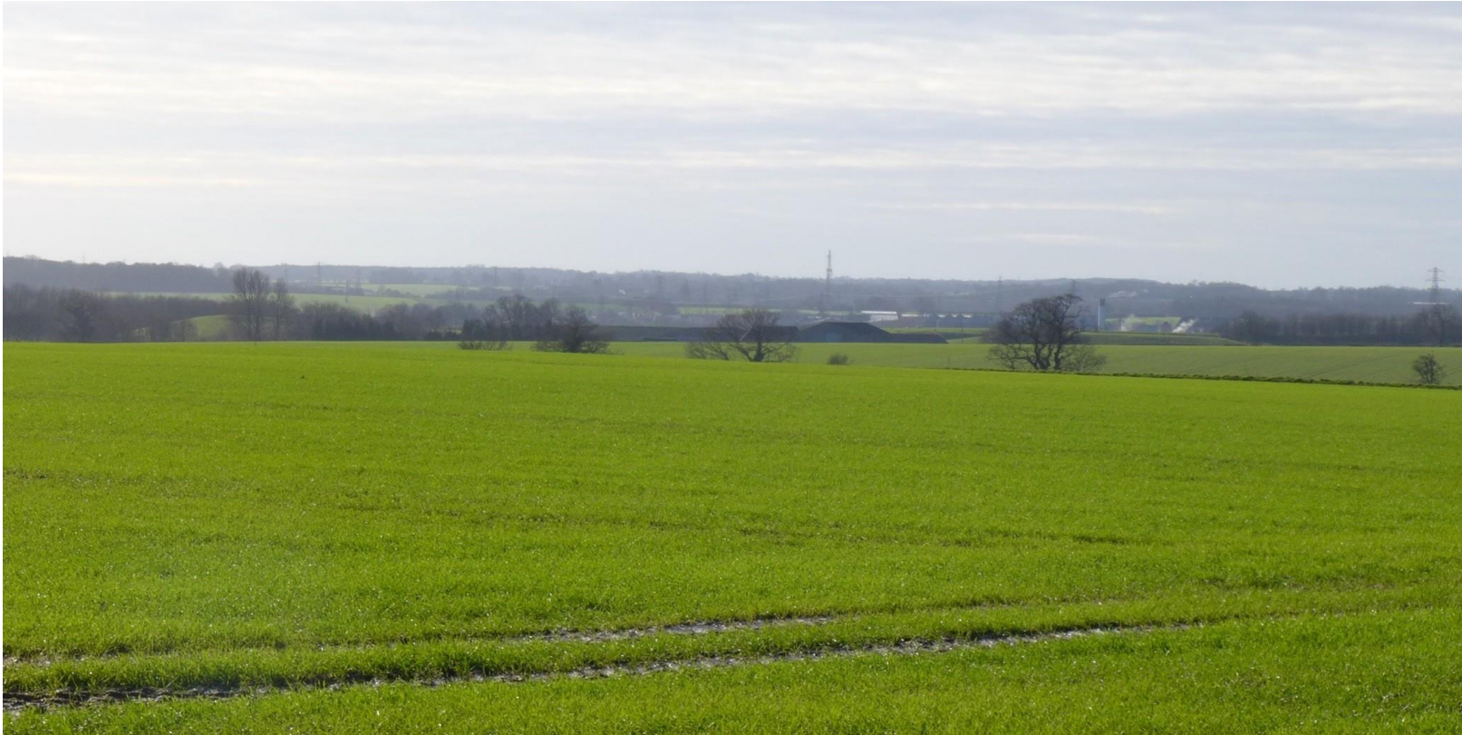
Looking toward Combs across Stowmarket