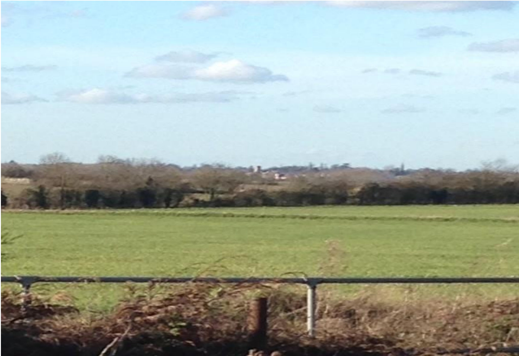
View towards Old Newton