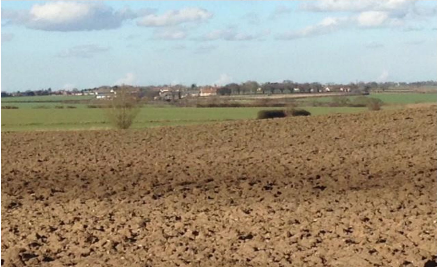
View towards Gipping