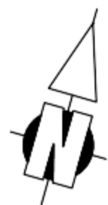
SITE PLAN - 1:500@A1