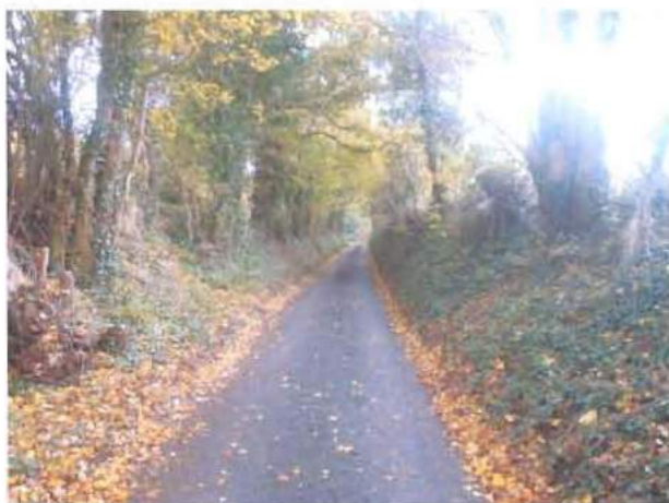
Traffic and Roads

Most residents have access to a car, but the youth of the Parish use a bus (30%) while the remainder used bicycles (38%) or walking (32%) as a means of getting to places outside the Parish.