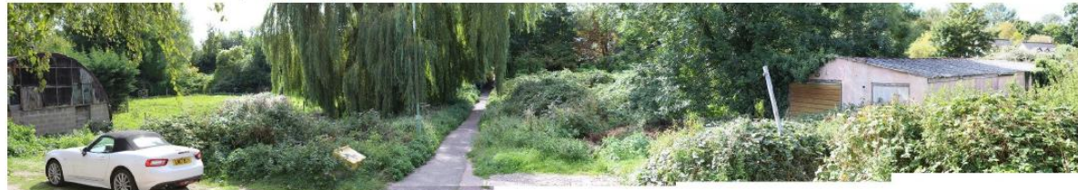
Viewpoint 10: View from shared footpath/cycle way between Wellington Road and Ash Drive looking South towards Hutton Court

This view is of the designated Visually Important Open Space adjacent to the tributary of the River Dove. It is available to pedestrians and cyclists although vehicles can access the non-residential buildings on both sides of the VIOS. The view is defined by trees along the watercourse and the dwellings on the southern side are not highly visible. The large Weeping Willow tree is a focal point and the openness of the field to the left of the path is visually important. The natural vegetation on the western side contains some old orchard trees and land on the eastern side is currently used for grazing. Taking these receptors into account, visual sensitivity to change is considered to be Medium .