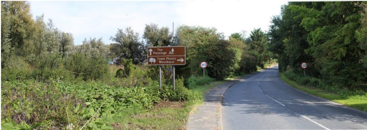
Viewpoint 4: View from Magdalen Street (B1117) looking East towards Eye Poultry factory on the edge of the town.

This view represents one of the main gateways into Eye from the B1117. It represents all users and modes of travel into and out of Eye as a footway is located along the left side of the road. The view is defined by the community woodland on the right side of the road with views towards the town and openness of the field and meadow to the left of the road. This visually important open space forms an important break towards Eye Poultry factory buildings which break the skyline and the canopies of the trees on the edge of the town. Taking these receptors into account, visual sensitivity to change is considered to be Medium . This defines the gateway into the historical core of the town and importantly, this viewpoint would be enhanced by the replacement of factory buildings with character dwellings.