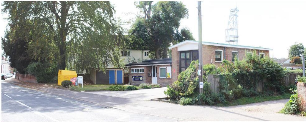
Viewpoint 9: View from Lambseth Street (B1077) looking South West towards Eye Fire station

This view is dominated by Eye Fire Station although the mature trees in the adjacent garden provide a focal point and break up the townscape of buildings within the Conservation Area. The training tower is a feature in the rear of this view which is available to all users and modes of travel as there are footways on both sides of the road. Taking these receptors into account, visual sensitivity to change is considered to be Medium . The trees in the gardens of properties bounding Lambseth Street are important to the view though the entrance to the Rettery Local Green Space to the north of the Fire Station could be enhanced with planting adjacent to the River Dove, just out of view. There are several visible dwellings which includes the functional fire station as well as Lambseth House and the street scene to the rear of the view within the town.