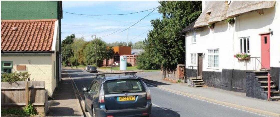
Viewpoint 3: View from Magdalen Street (B1117) looking West towards Eye Poultry factory on the edge of the town.

This view represents one of the main gateways out of Eye from the B1117. It represents all users and modes of travel into and out of Eye as a footway is located along both sides of the road. The view is defined by the character buildings on the right side of the road with views towards Eye Poultry factory with the modern buildings are partially screened by tree canopies. The view contains a skyline of trees which frame the western edge of the town. To the left, the dwellings comprise buildings from the former railway terminus. Taking these receptors into account, visual sensitivity to change is considered to be Medium . This defines the gateway into the historical core of the town and importantly, this viewpoint would be enhanced by the replacement of factory buildings with character dwellings.