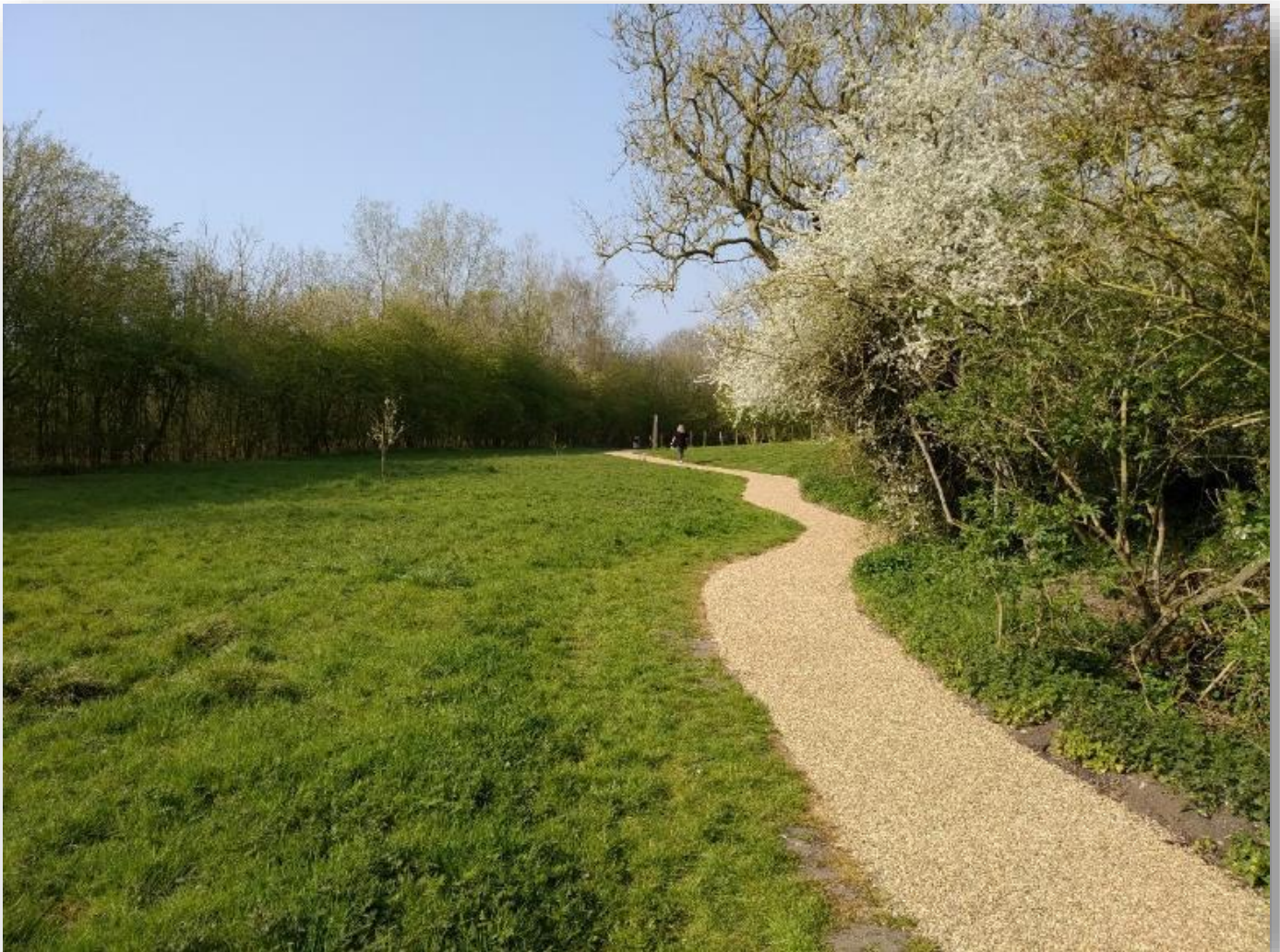
Pocket Park, a proposed Local Green Space in Scole