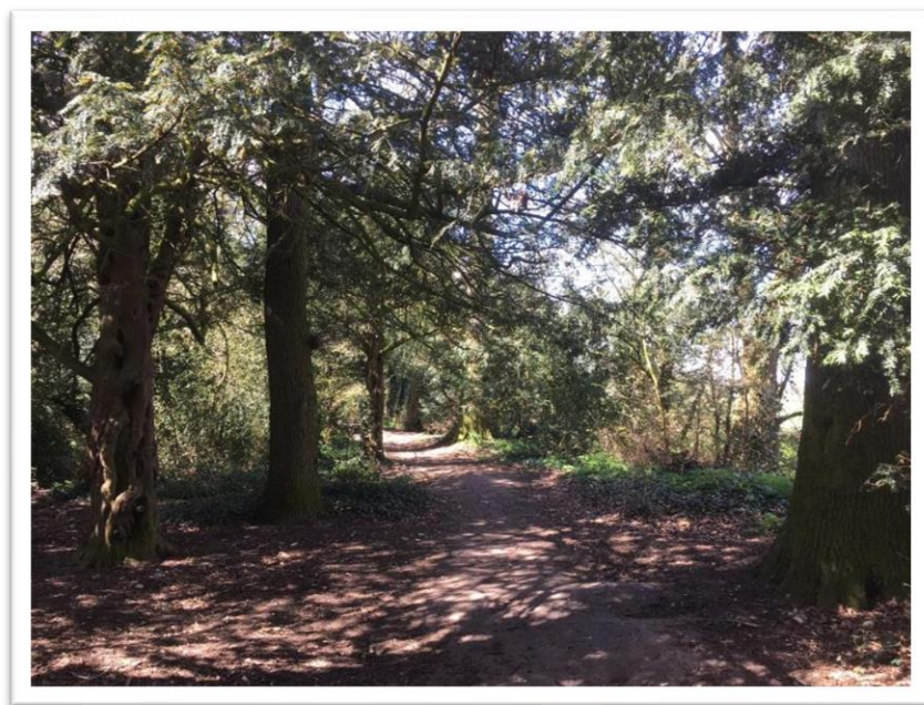
Local Green Space image 1: Swamp Lane Wood, Roydon

Any landowners affected by LGS designation were specifically contacted to make them aware of the potential implications and given the opportunity to provide their views.