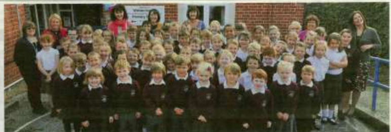
TOP OF THE CLASS: Staff and pupils at Wetheringsett Primary School celebrate their success