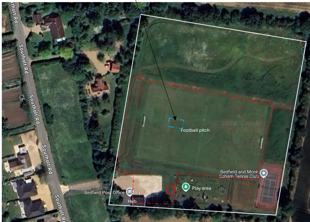
Aerial views showing the entire field, buildings, football pitch, tennis court. The white outline shows the extent of the land rented by the Community Club.