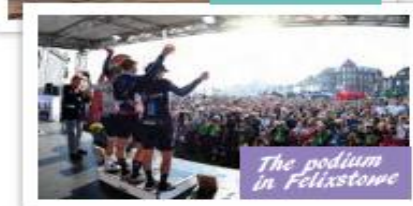
The podium in Felixstowe

Postponed in 2020 due to the Covid 19 pandemic, the 2021 AJ Bell Women's Tour was rescheduled from its usual slot in June to October. Part of the UCI Women's WorldTour calendar, the 6 stage race started on the 4th October in Bicester Oxfordshire and finished along the seafront in Felixstowe on Saturday October 9th. The final stage in Suffolk saw the teams and riders leave Haverhill and race through 155km of Suffolk's countryside and communities to finish in front of thousands of spectators on the seafront in Felixstowe.