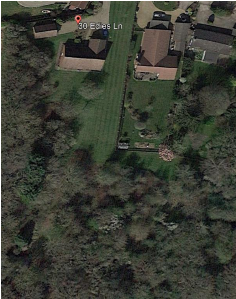
Figure 2. 22.03.2022